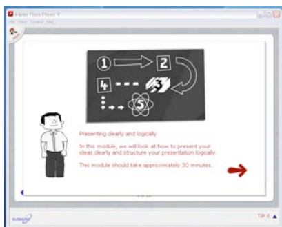
Screenshot from The Great Presenter

“Learners will be able to study at their own pace, anywhere they like, in a way which is both fun and engaging.”